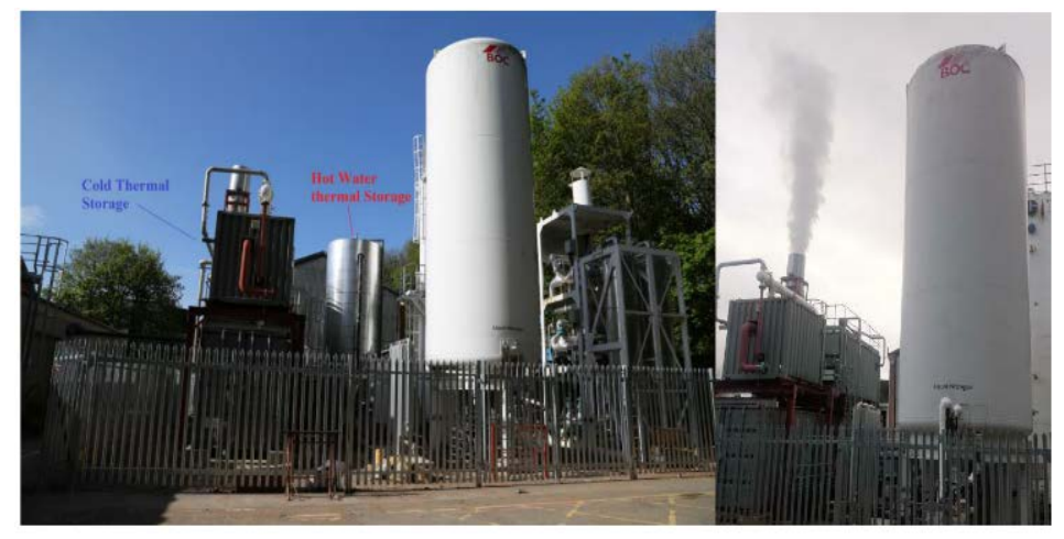
Figure 3. LAES Pilot plant at University of Birmingham.

Compared with other large scale energy storage technologies, LAES has the advantage of geographically unconstrained. This feature is particularly significant when coupling with existing processes is considered. The availability of cold makes it possible to effectively utilize various waste heat sources. The technology can also effectively use waste process cold from e.g. evaporation of LNG. Main barriers are associated with lack